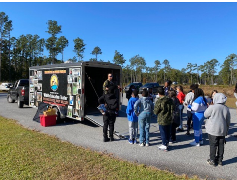
Various NC Wildlife officers lead students through the Wildlife trailer.

The District appreciates the assistance of all those involved that make this yearly event possible.